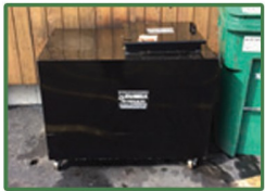
650 Litre Vats

We provide collection containers free of charge. All containers are made of carbon steel and all VATs are made right here in North America.