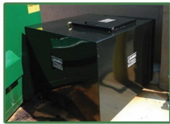
1300 Litre Vats

Or: We can pump directly from your tank.